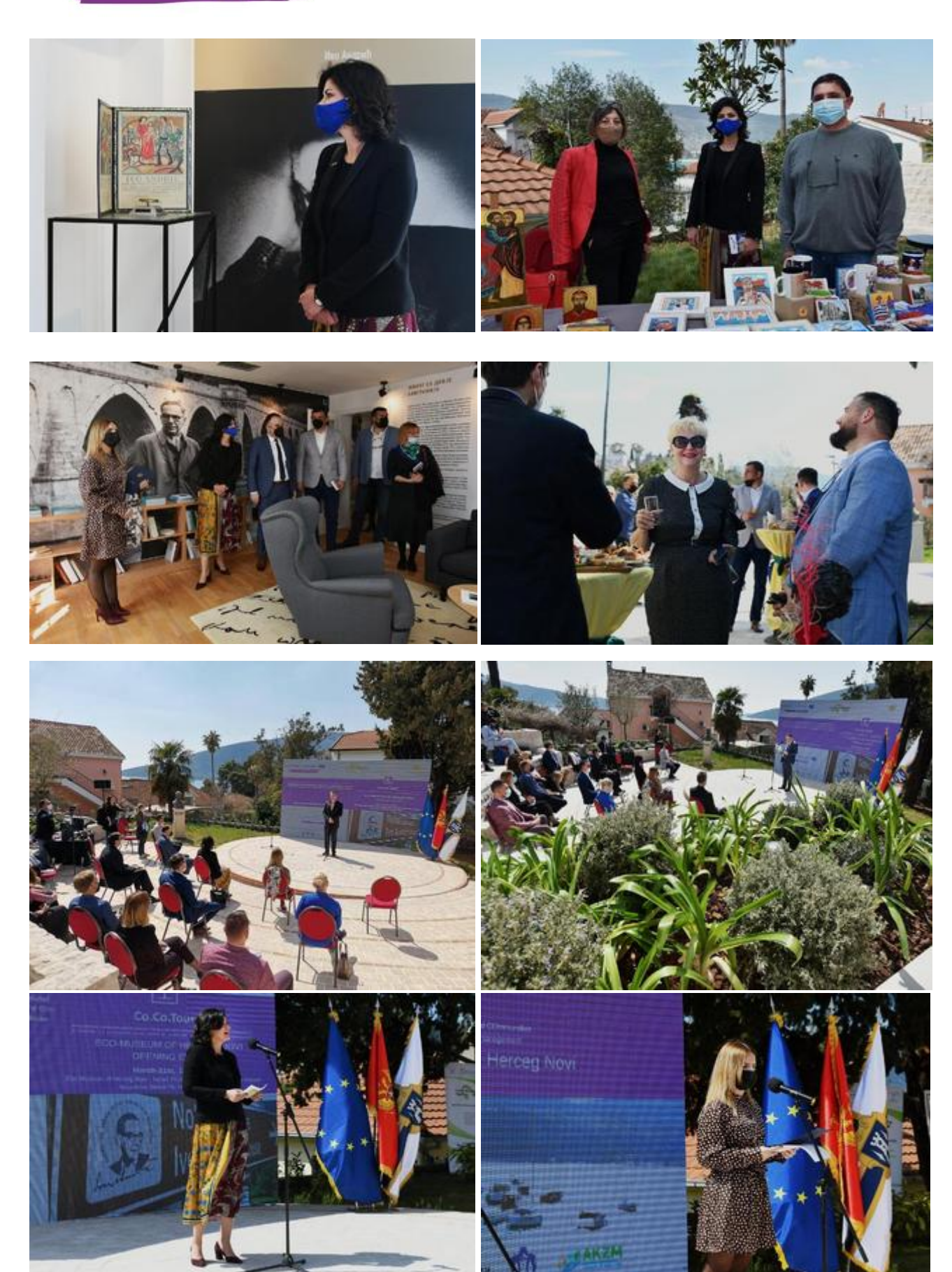
T3.1- Eco-museums target spaces renewed and equipped